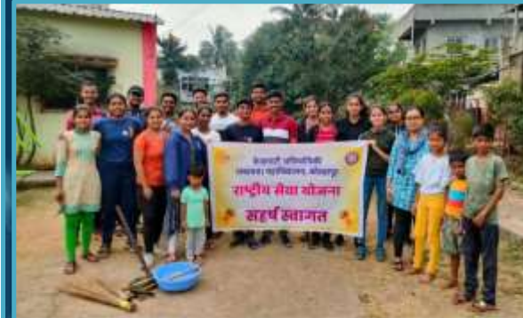
के.आर.टी.च्या रा.स्.पो.कडून कोल्हापूरमधील रामनंद नगर येथील डॉ.बी.पी.स्वच्छता कक्षात सहभाग