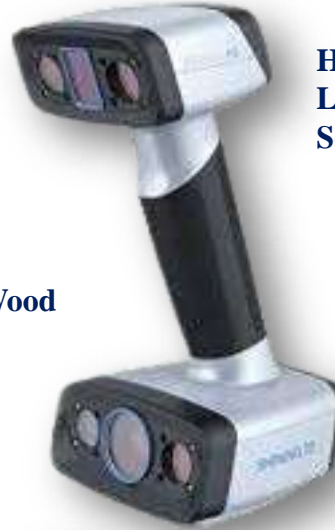
Handheld blue Laser Light 3D Scanner