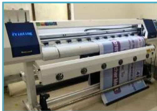
Eco solvent Printer