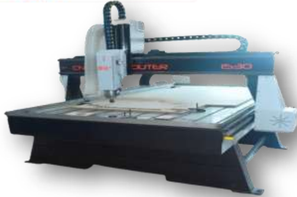
CNC Wood Router