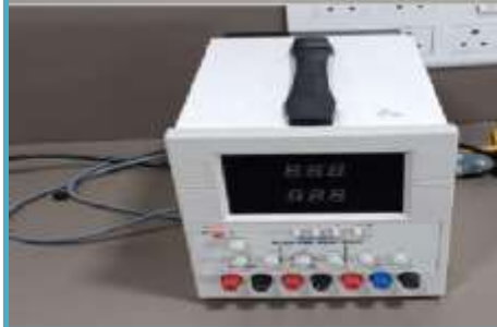
Variable Power Supply