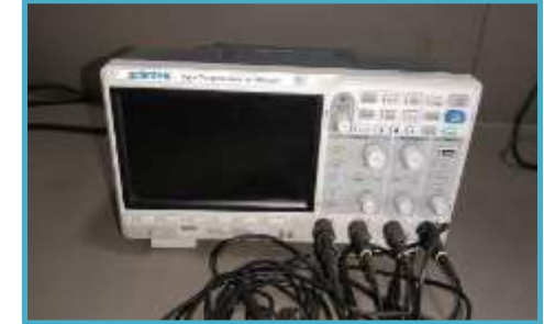
Mixed Signal Oscilloscope