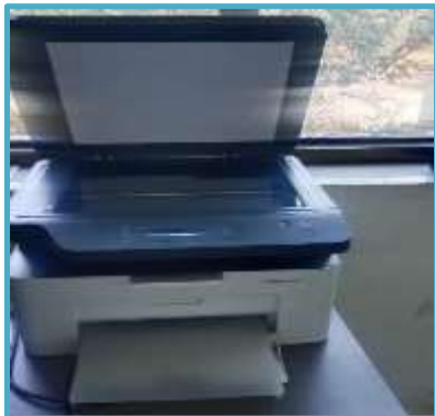
Heavy Duty Laser Printer