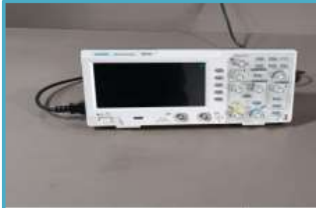
Digital Storage Oscilloscope