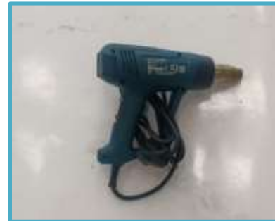
Plastic Heat Gun