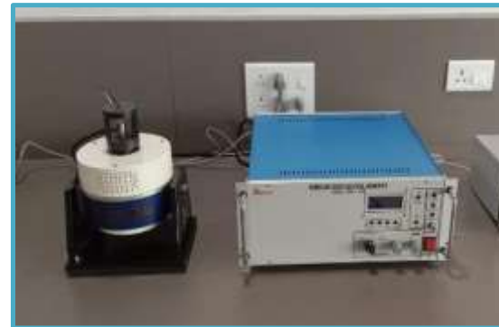
Electrodynamic vibration shaker