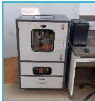
PCB Milling Machine